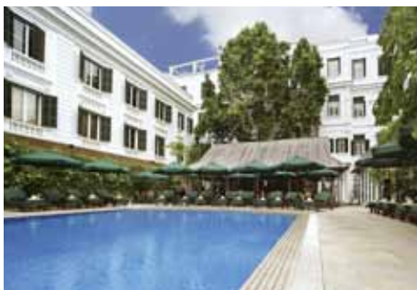
Sofitel Metropole - Hanoi