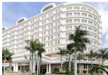
Park Hyatt - Ho Chi Minh City